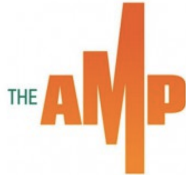
Co-Working Office Space